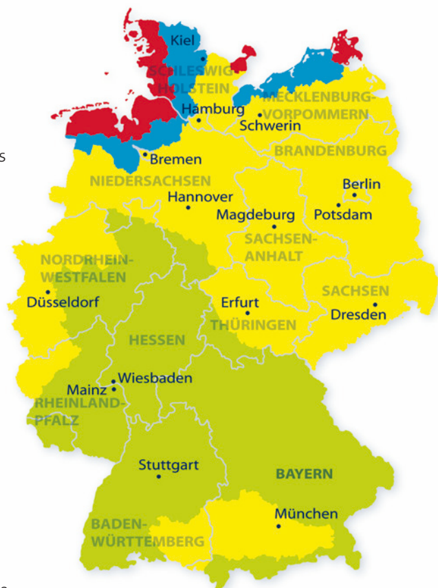
Table for classification according to administrative boundaries, see Table on next page.

Germany is divided into four regional wind load zones (WLZ 1 to WLZ 4). This specification is underpinned by the criteria of the average wind speeds. The wind load zone map shown in DIN EN 1991-1-4/NA is relatively inaccurate. We recommend using the tables published by Deutsches Institut für Bautechnik ( www.dibt.de ) for classification according to administrative boundaries.